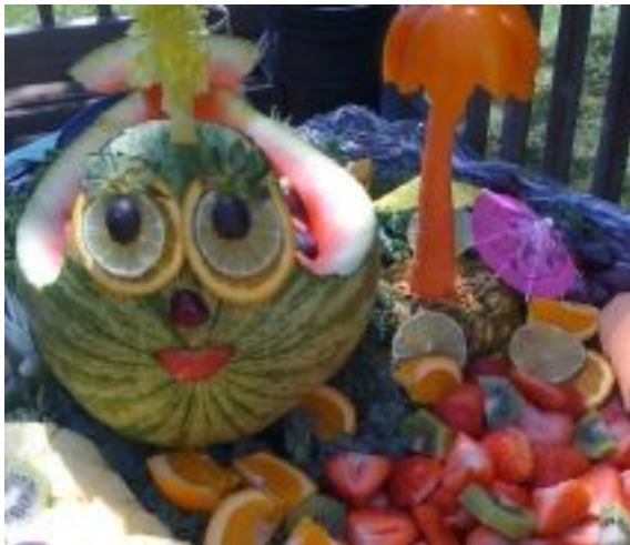
One of the fabulous desserts created by our chef, Randy!