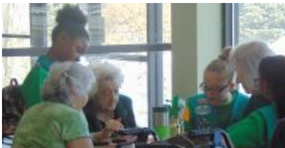
Concentration is the key to a winning card.