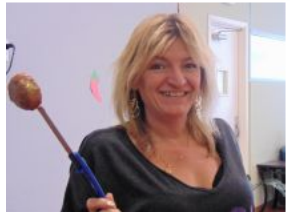
Guess who made the blue ribbon chili!