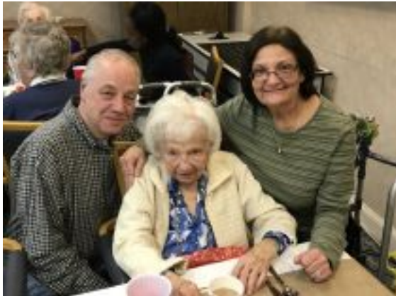
A FEW GOOD MOMS!

Nurses inspire, innovate and influence, and that is the theme of Nurses Week, May 6–12. Take the time to give a heartfelt thank-you to our nurses for their hard work and care during this week—and every week!