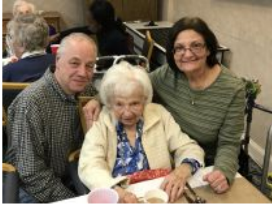
A FEW GOOD MOMS!

Nurses inspire, innovate and influence, and that is the theme of Nurses Week, May 6–12. Take the time to give a heartfelt thank-you to our nurses for their hard work and care during this week—and every week!