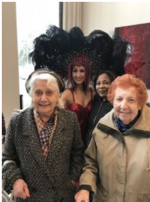
Thanks to the Willows at Ramapo For a Great Afternoon!