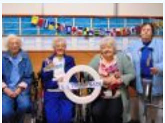
You meet many new friends aboard ship!