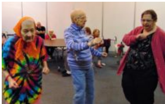
Time to boogie!