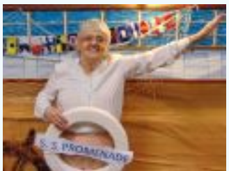
...And away we go!