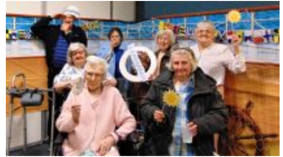
The gang's all here ready to set sail!