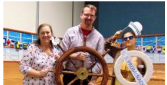
Meet your cruise directors!