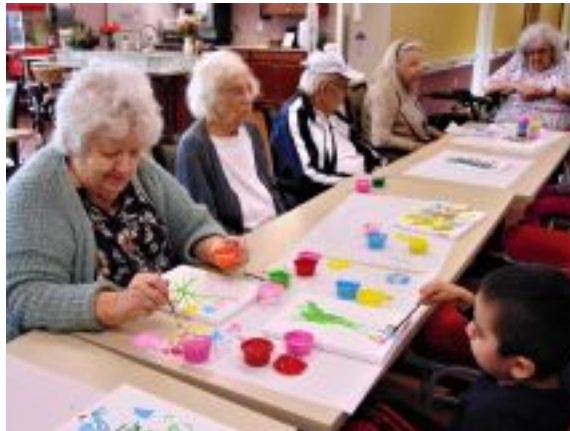
Our visiting preschoolers created some artwork.