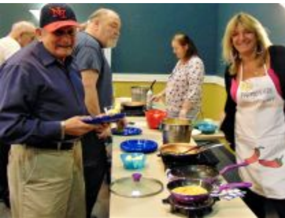
Flip those omelets!