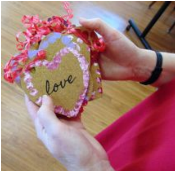
Our friends from Middletown Day Nursery made us Valentine's Day gifts and sang some songs!

Thanks to Mary Kay Cosmetics for a great spa day!