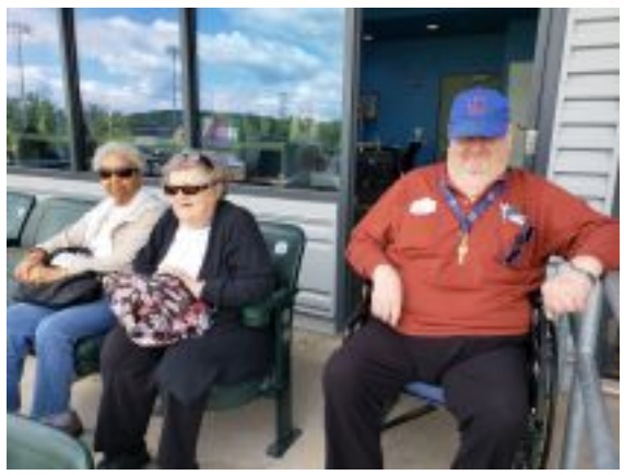
It's not every day you get a luxury box!