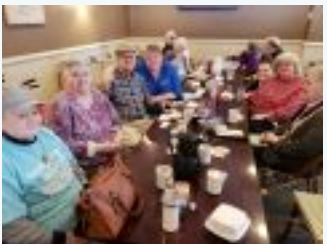
Enjoying our bi-weekly brunch at Maddy's Diner is a Promenade tradition.