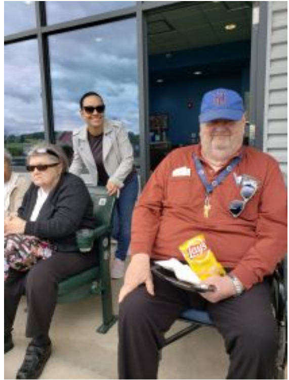
Last month, we went out to the ballpark to see the Rockland Boulders, a semi-pro team based in Pomona, NY. We even had a skybox at the park!