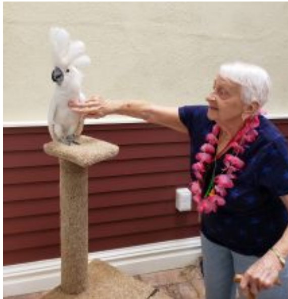
Her Majesty, the cockatiel, is not amused.