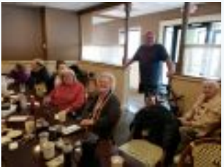
Our brunches are always standing room only and are one of the most popular highlights of our activity schedule.