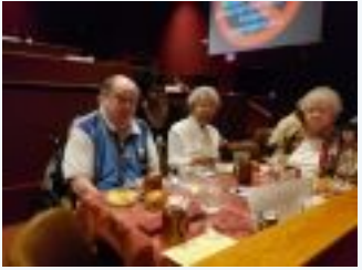
Part of the crew that went to Westchester Dinner Theater to see a production of Sister Act!