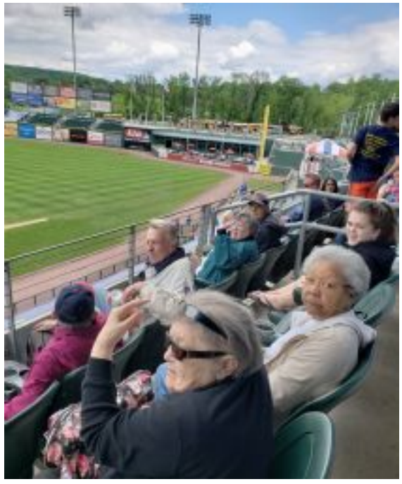
The skies were gloomy, but the view was great!