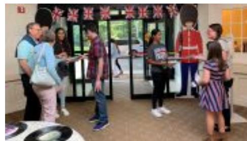
Volunteers distributing referral information

Do you have friends that you wish lived here too? Some close friends that you truly adore When you refer us and your friends move in You will see them much more than before! 'Cause, you referred Promenade to your friends You'll be so glad now, with so many friends Yes, please refer Promenade to your friends! If they need senior living, Refer Promenade Family Did you hear we are giving Rewards for joining our family tree