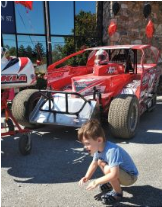
Just a boy and his race car!