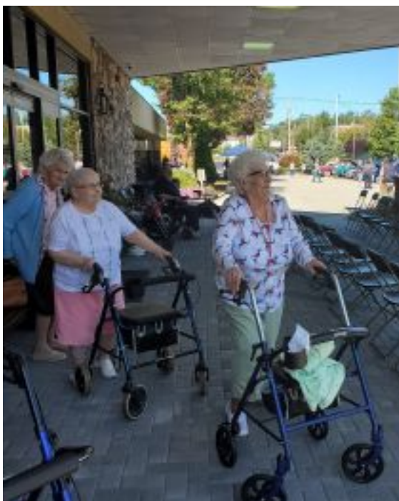
The neighborhood watch has arrived!