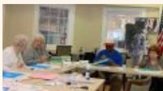
Creative juices at work.