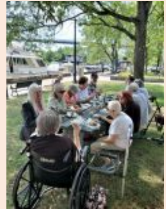
Last month, we took our annual late summer cruise down the Hudson River. We embarked from the scenic Rondout area in Kingston after picnicking al fresco near the river.