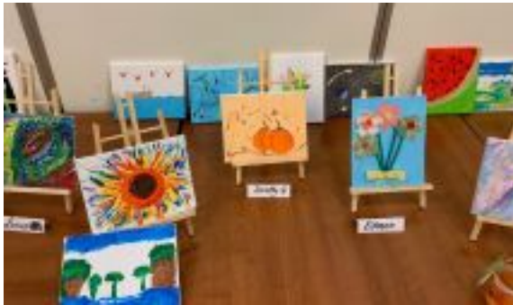
As part of Assisted Living Week, we sponsored an Art Show where some of the work done by our residents was on display.

Our October Surprises Weren't Finalized at Press Time, But Stay Tuned!