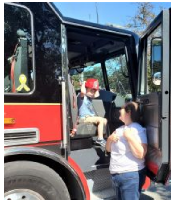
Hail to the Chief!