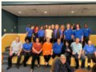
Staff at the dance party!